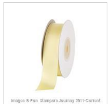
Satin Ribbon Sweet Pear