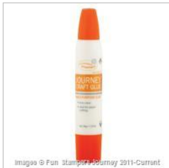
Journey Craft Glue