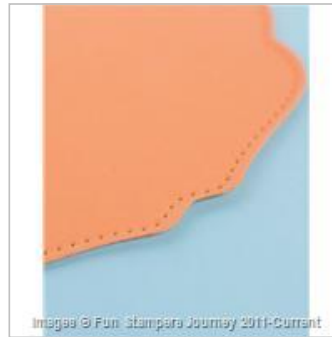
Treat Label Bundle