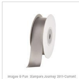
Satin Ribbon River Stone