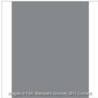
River Stone 8.5x11