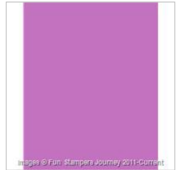
Lavender Fusion 8.5 x