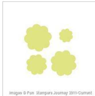
Summer Pretties Punch Cartridge