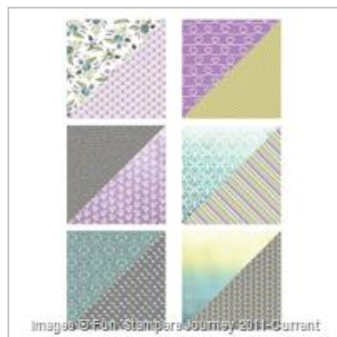
Summer Romance Printed Paper