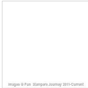
Whip Cream 8.5 x 11