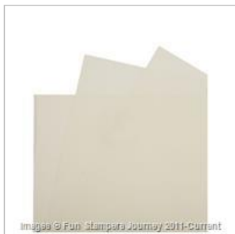
Clear View Sheets