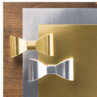
Gold Foil Sheets