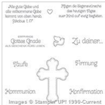
Segenswünsche Clear-Mount Stamp Set (German)