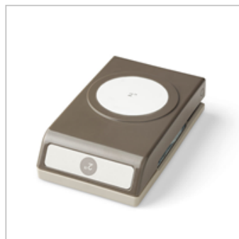
2\" (5.1 Cm) Circle Punch