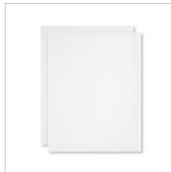
Vellum A4 Cardstock