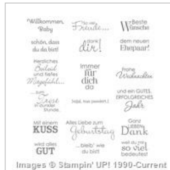
Perfekte Pärchen Clear-Mount Stamp Set (German)