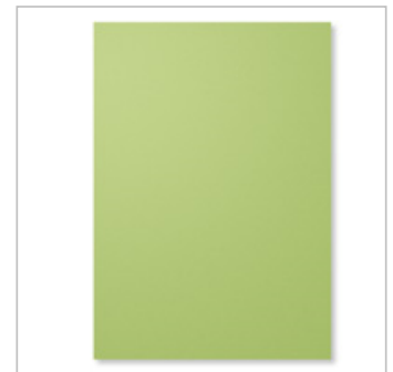
Pear Pizzazz A4 Cardstock