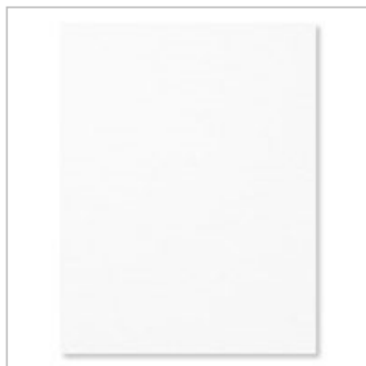
Whisper White A4 Cardstock