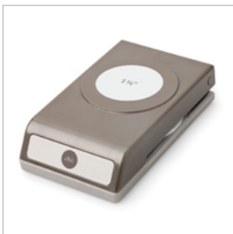
1-3/4\" (4.4 Cm) Circle Punch