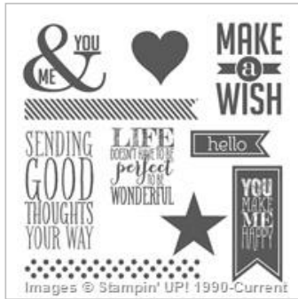
Perfect Pennants Clear-Mount Stamp