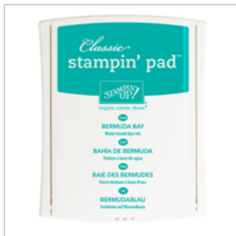
Bermuda Bay Classic Stampin' Pad