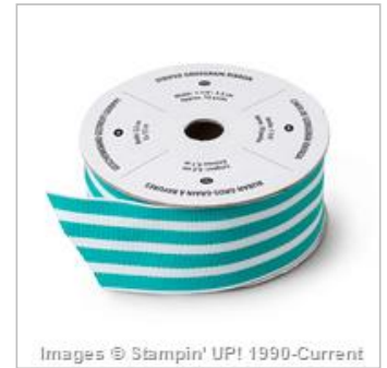
Bermuda Bay 1-1/4" Striped Grosgrain