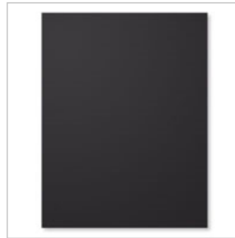
Basic Black A4 Cardstock