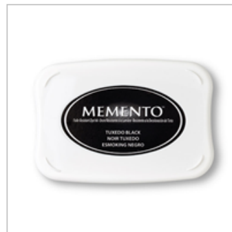
Tuxedo Black Memento Ink Pad