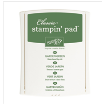
Garden Green Classic Stampin' Pad