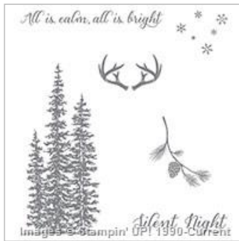
Wonderland Clear-Mount Stamp Set