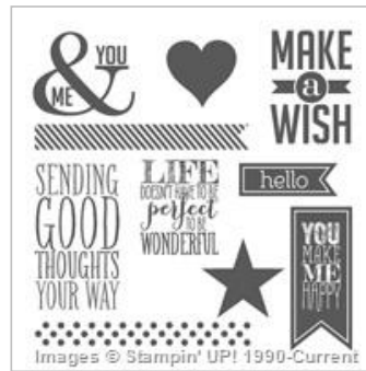
Perfect Pennants Clear-Mount Stamp Set