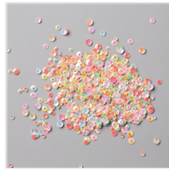
Iridescent Sequin Assortment - 144212