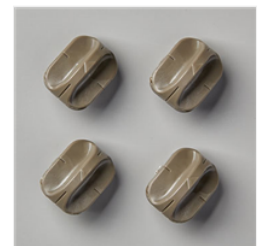
Cutting Blades Multipack - 152391