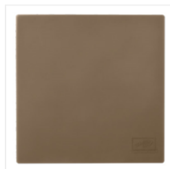
Silicone Craft Sheet - 127853