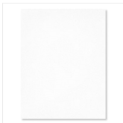
Shimmery White 8-1/2\" X 11\" Cardstock - 101910