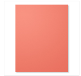
Calypso Coral 8-1/2\" X 11\" Cardstock - 122925