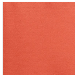
Subtle 3D Embossing Folder - 151775