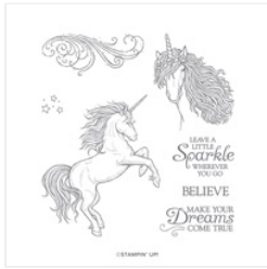
Leave A Little Sparkle Cling Stamp Set - 149292