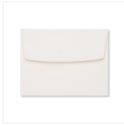
Very Vanilla Medium Envelopes - 107300