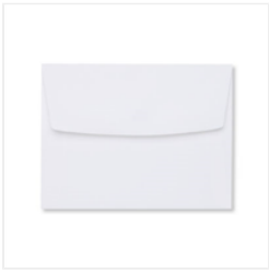
Whisper White Medium Envelopes - 107301