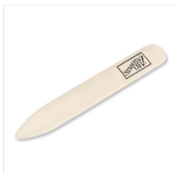
Bone Folder - 102300