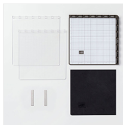
Stamparatus - 146276