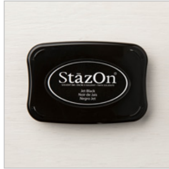
Jet Black Stzon Ink