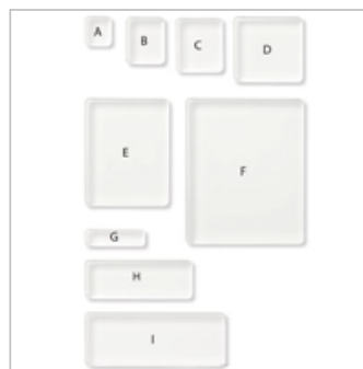
Clear Block Bundle