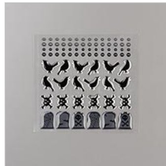
Monster Bash Enamel Shapes