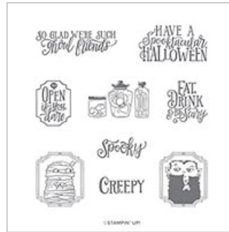
Spooktacular Bash Cling Stamp Set