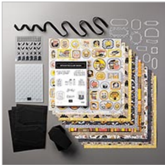
Monster Bash Suite Bundle (En)