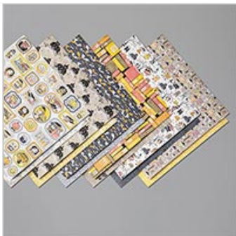
Monster Bash Designer Series