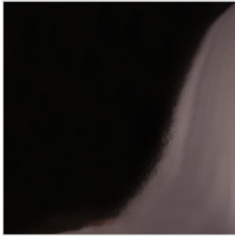
Black Foil Sheets