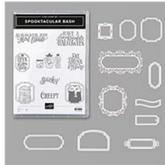
Spooktacular Bash Bundle