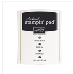
Basic Black Archival Stampin' Pad - 140931