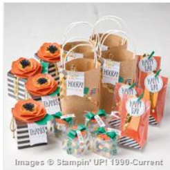
Perfectly Wrapped Project Kit - 142439