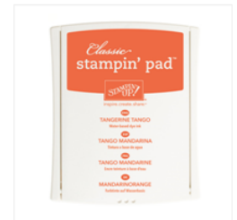
Tangerine Tango Classic Stampin' Pad - 126946