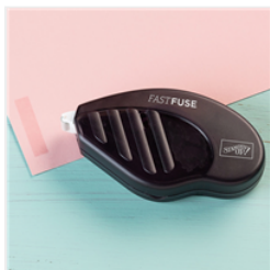
Fast Fuse Adhesive - 129026