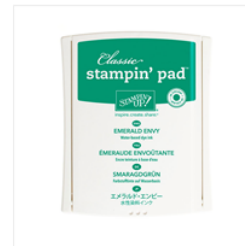
Emerald Envy Classic Stampin' Pad - 141396