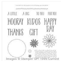
Perfectly Wrapped Photopolymer Stamp Set - 141960