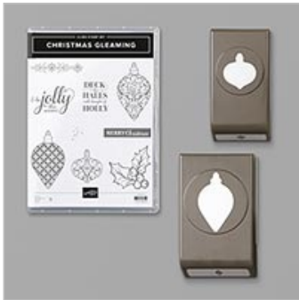
Christmas Gleaming Bundle (En)