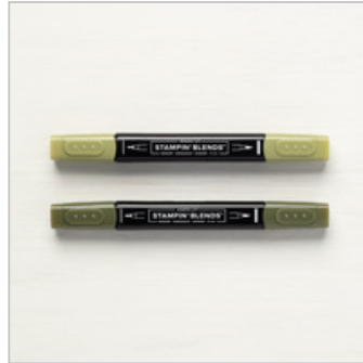
Mossy Meadow Stampin' Blends Combo Pack