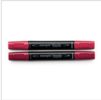
Cherry Cobbler Stampin' Blends Markers Combo Pack