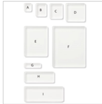
Clear Block Bundle