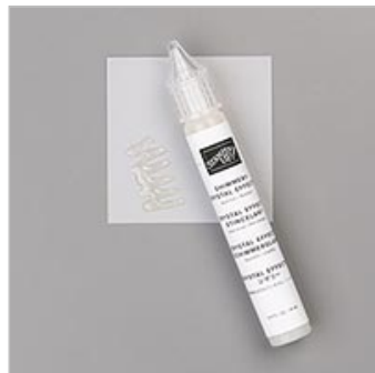
Shimmery Crystal Effects