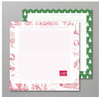
Seasonal 2019 13" X 13" (33 X 33 Cm) Grid Paper