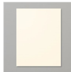
Very Vanilla 8-1/2" X 11" Cardstock - 101650