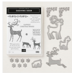
Dashing Deer Clear-Mount Bundle - 149935