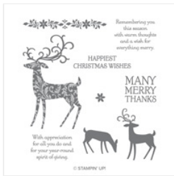
Dashing Deer Clear-Mount Stamp Set - 147728