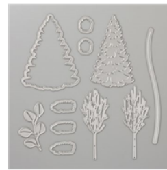
In The Woods Dies - 147919