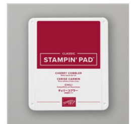
Cherry Cobbler Classic Stampin' Pad - 147083