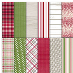
Festive Farmhouse 12" X 12" (30.5 X 30.5 Cm) Designer Series Paper - 147820