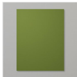
Mossy Meadow 8- 1/2" X 11" Cardstock - 133676