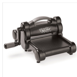
Big Shot - 143263