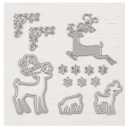
Detailed Deer Dies - 147915