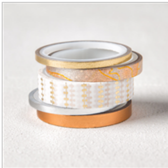
Year Of Cheer Specialty Washi Tape