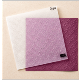
Quilt Top Textured Impressions Embossing Folder