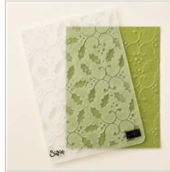
Holly Textured Impressions Embossing Folder