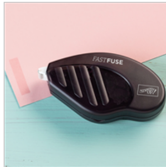
Fast Fuse Adhesive