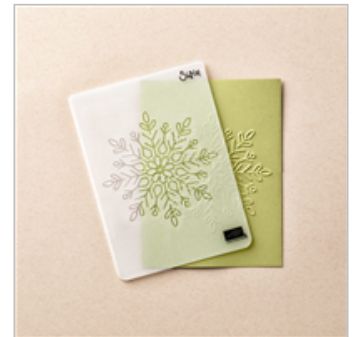
Winter Wonder Textured Impressions Embossing Folder*