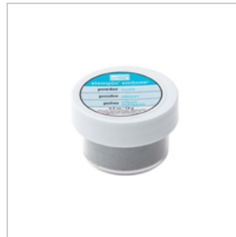
Silver Stampin' Emboss Powder