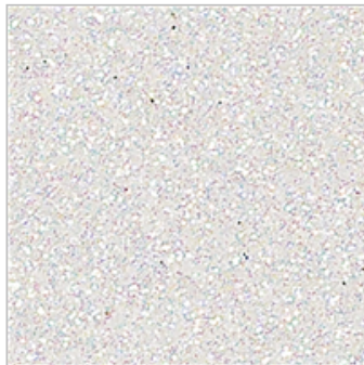
Dazzling Diamonds Glimmer Paper