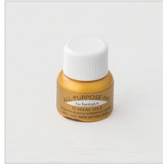
Vegas Gold Shimmer