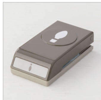
Christmas Bulb Builder Punch