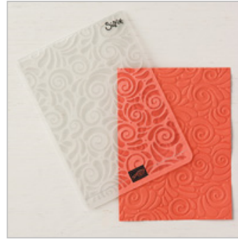
Swirls & Curls Textured Impressions Embossing Folder