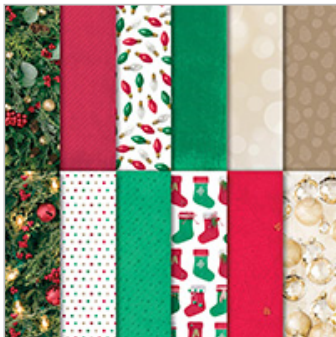
All Is Bright 12" X 12" (30.5 X 30.5 Cm) Designer Series Paper