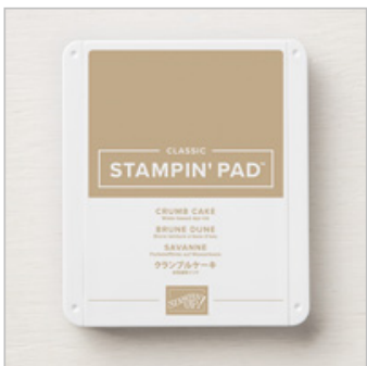
Crumb Cake Classic Stampin' Pad