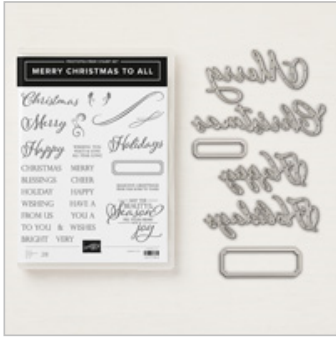
Merry Christmas To All Photopolymer