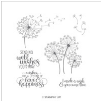
Dandelion Wishes Clear-Mount Stamp