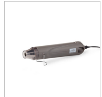
Heat Tool (Us And Canada)