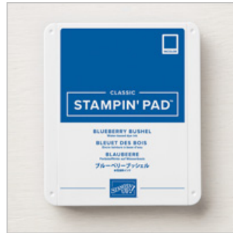
Blueberry Bushel Classic Stampin' Pad