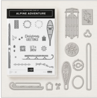
Alpine Adventure Photopolymer Bundle