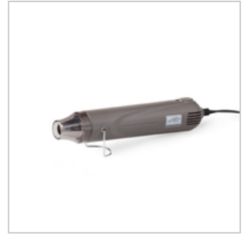
Heat Tool (Us And Canada)