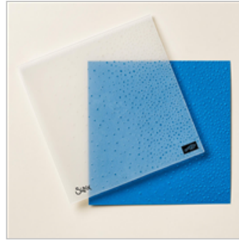
Softly Falling Textured Impressions Embossing Folder