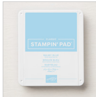
Balmy Blue Classic Stampin' Pad