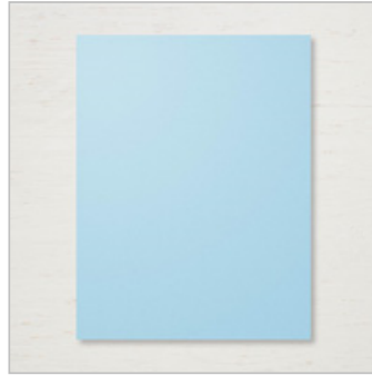
Balmy Blue 8-1/2" X 11" Cardstock