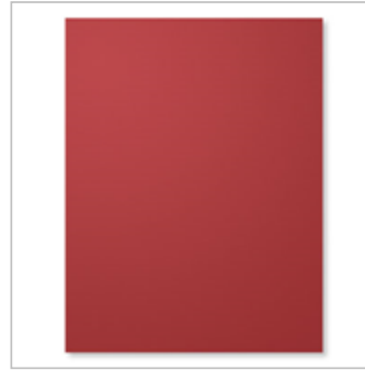
Cherry Cobbler 8-1/2" X 11" Cardstock