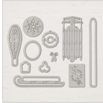
Alpine Sports Thinlits Dies