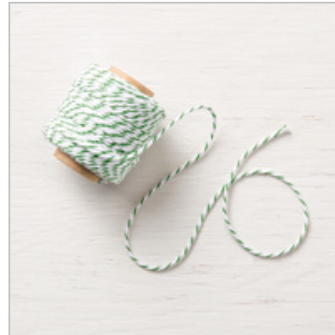
Garden Green & White Baker's Twine