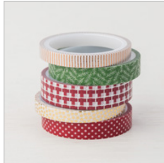
Suite Season Specialty Washi Tape