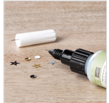
Fine-Tip Glue Pen