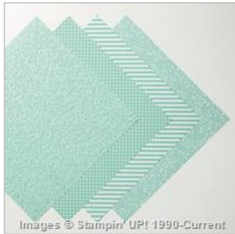
2015-2017 In Color Designer Series Paper Stack