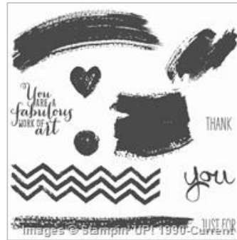
Work Of Art Clear- Mount Stamp Set