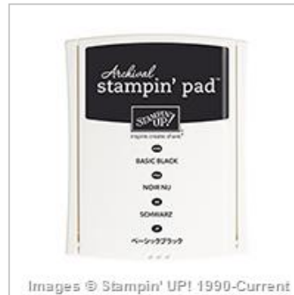
Basic Black Archival Stampin' Pad