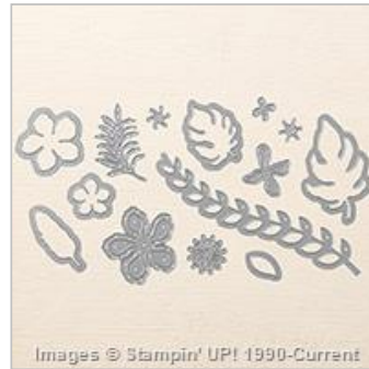
Botanical Builder Framelits Dies