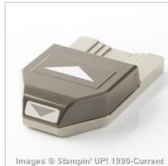
Banner Triple Punch