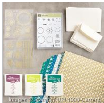
Eastern Palace Starter Bundle