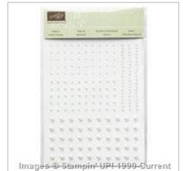
Pearl Basic Jewels