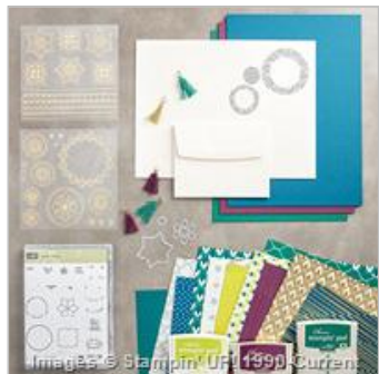
Eastern Palace Premier Bundle