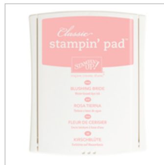
Blushing Bride Classic Stampin' Pad