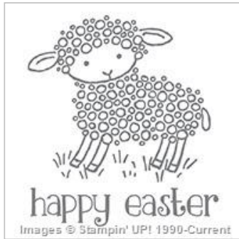
Easter Lamb Wood-Mount Stamp