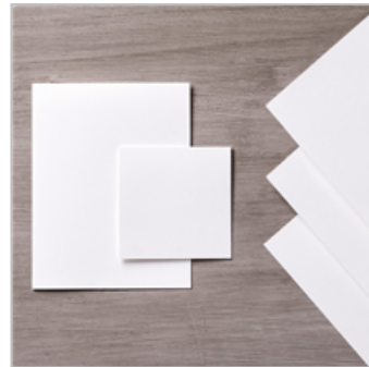
Whisper White 8-1/2\"/>