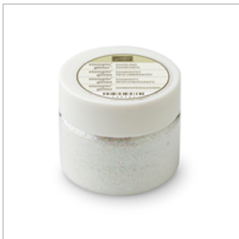
Dazzling Diamonds Stampin' Glitter