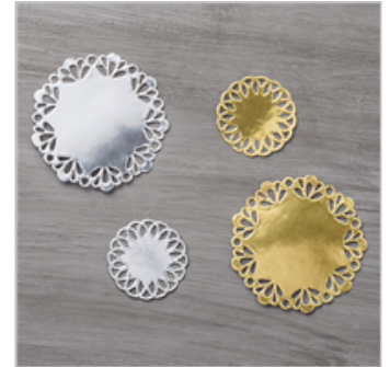
Metallic Foil Doilies