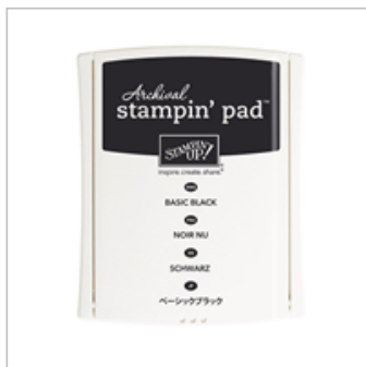
Basic Black Archival Stampin' Pad