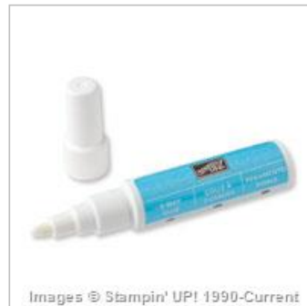
2-Way Glue Pen