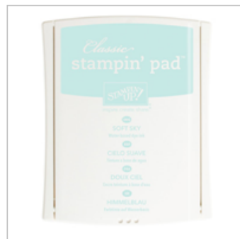
Soft Sky Classic Stampin' Pad