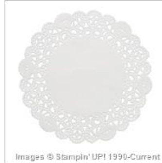
Tea Lace Paper Doilies