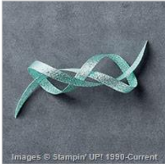
Pool Party 3/8" (1 Cm) Glitter Ribbon