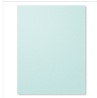
Soft Sky 8-1/2\"/>