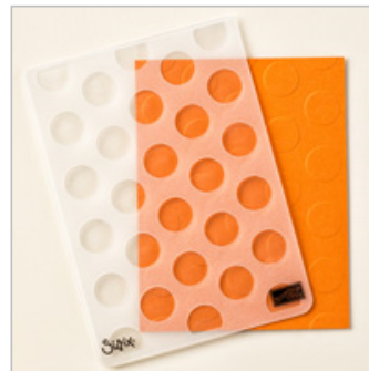
Polka Dot Textured Impressions Embossing Folder