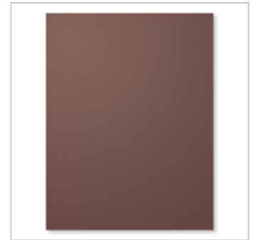
Chocolate Chip 8-1/2" X 11" Cardstock