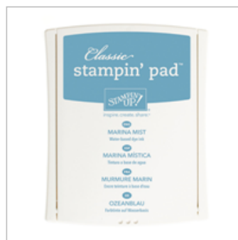
Marina Mist Classic Stampin' Pad