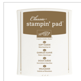
Soft Suede Classic Stampin' Pad