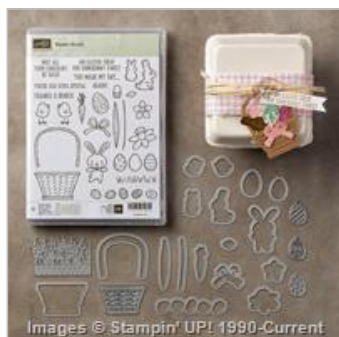
Basket Bunch Photopolymer Bundle