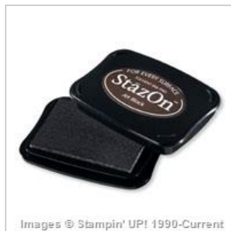
Jet Black Stazon Pad