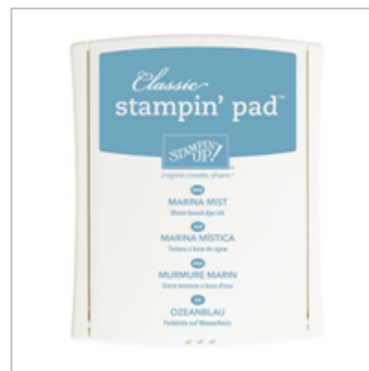
Marina Mist Classic Stampin' Pad