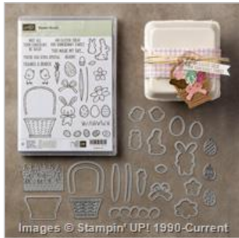
Basket Bunch Photopolymer Bundle