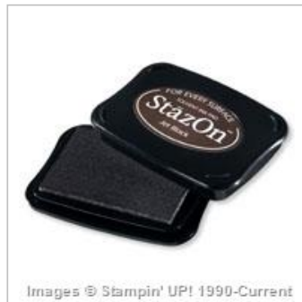
Jet Black Stazon Pad