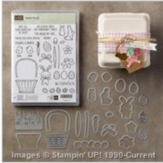
Basket Bunch Photopolymer Bundle