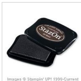
Jet Black Stazon Pad