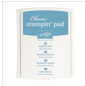
Marina Mist Classic Stampin' Pad