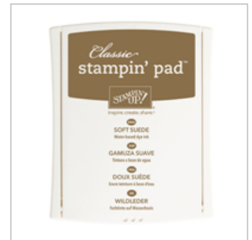
Soft Suede Classic Stampin' Pad