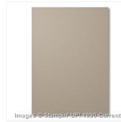
Tip Top Taupe A4 Cardstock - 138343