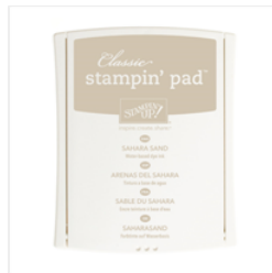
Sahara Sand Classic Stampin' Pad - 126976