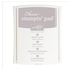
Smoky Slate Classic Stampin' Pad - 131179