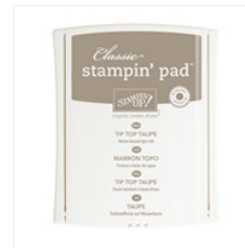
Tip Top Taupe Classic Stampin' Pad - 138325