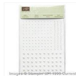
Pearl Basic Jewels - 119247