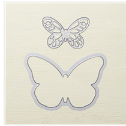
Bold Butterfly Framelits Dies - 138135