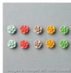
2015-2017 In Color Blossom Accents - 138383