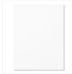
Whisper White A4 Cardstock - 106549