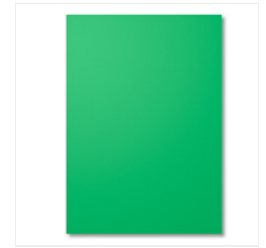
Cucumber Crush A4 Cardstock - 138342