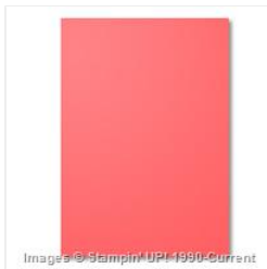
Watermelon Wonder A4 Cardstock - 138341