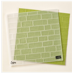
Brick Wall Textured Impressions Embossing Folder - 138288