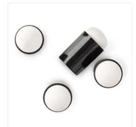
Sponge Daubers - 133773