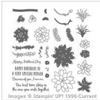
Oh So Succulent Photopolymer Stamp