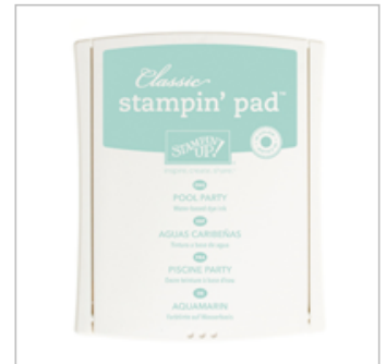
Pool Party Classic Stampin' Pad