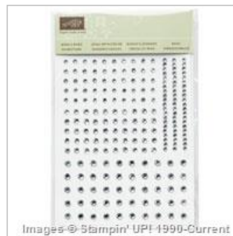
Rhinestone Basic Jewels