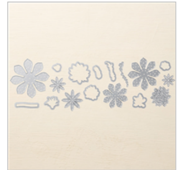
Succulent Framelits Dies