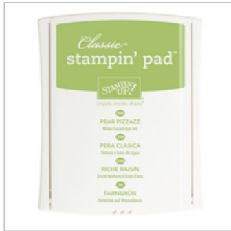
Pear Pizzazz Classic Stampin' Pad