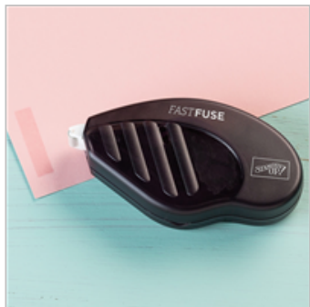
Fast Fuse Adhesive