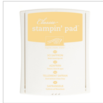
So Saffron Classic Stampin' Pad