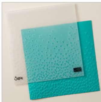
Falling Petals Textured Impressions Embossing Folder