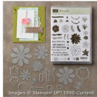
Oh So Succulent Photopolymer Bundle