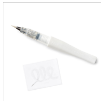
Clear Wink Of Stella Glitter Brush