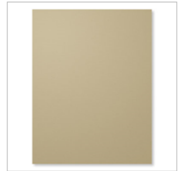
Crumb Cake 8-1/2" X 11" Cardstock