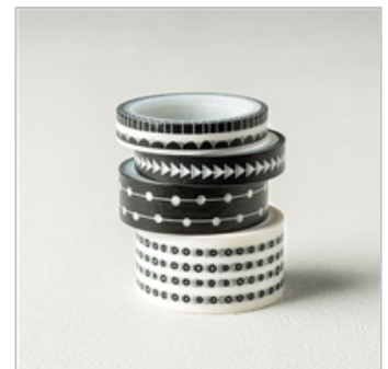
Pick A Pattern Washi Tape