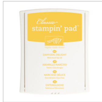
Daffodil Delight Classic Stampin' Pad