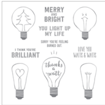
Watts Of Occasions Clear-Mount Stamp