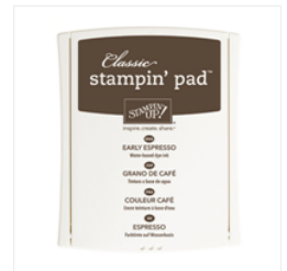
Early Espresso Classic Stampin' Pad