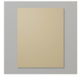
Crumb Cake 8-1/2" X 11" Cardstock