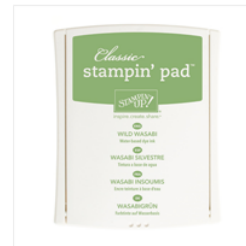
Wild Wasabi Classic Stampin' Pad