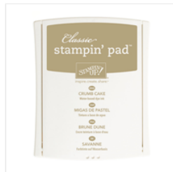
Crumb Cake Classic Stampin' Pad