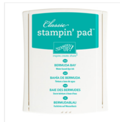
Bermuda Bay Classic Stampin' Pad