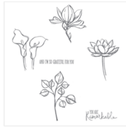
Remarkable You Wood-Mount Stamp Set