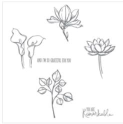
Remarkable You Clear-Mount Stamp Set

http://www.stampinup.net/esuite/home/debbiehenderson/