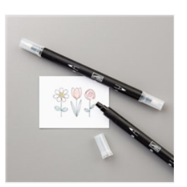
Blender Pens -102845