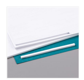
Foam Adhesive Strips - 141825

Renee Daley 703-620-1577 <u>Stampknowhow@verizon.net</u> <u>www.StampKnowHow.com</u>