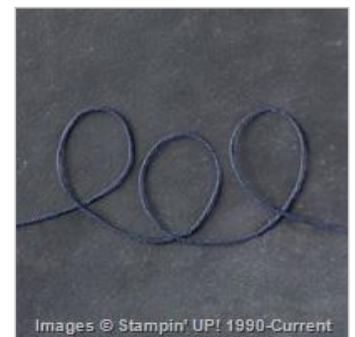
Night Of Navy Solid Baker's Twine