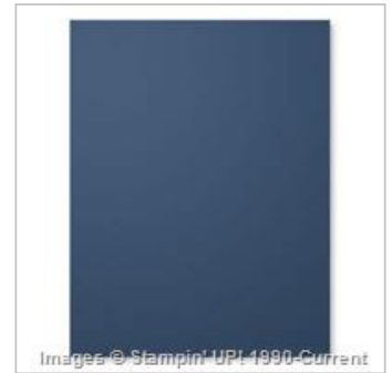
Night Of Navy 8-1/2" X 11" Cardstock