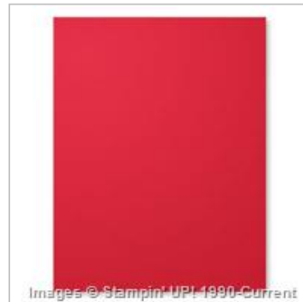
Real Red 8-1/2" X 11" Cardstock