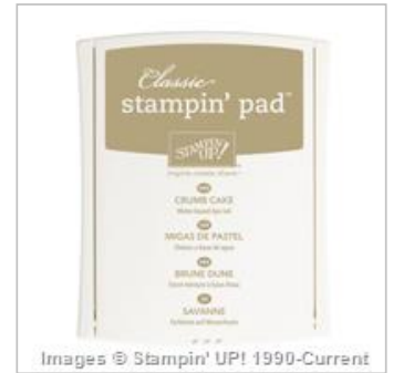
Crumb Cake Classic Stampin' Pad