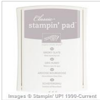
Smoky Slate Classic Stampin' Pad