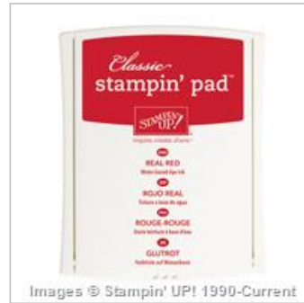
Real Red Classic Stampin' Pad