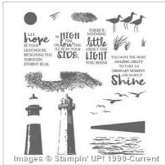
High Tide Photopolymer Stamp