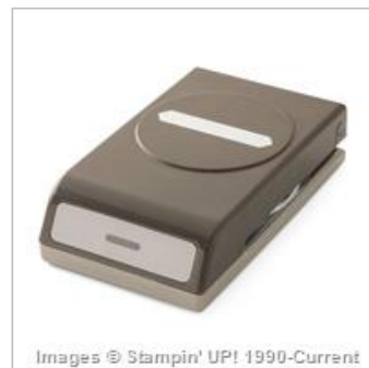
Classic Label Punch