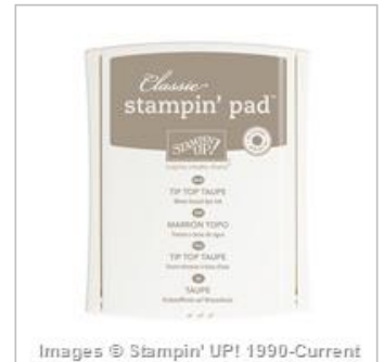
Tip Top Taupe Classic Stampin' Pad