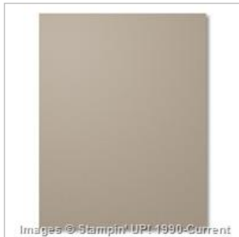
Tip Top Taupe 8-1/2" X 11" Cardstock