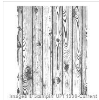
Hardwood Wood- Mount Stamp