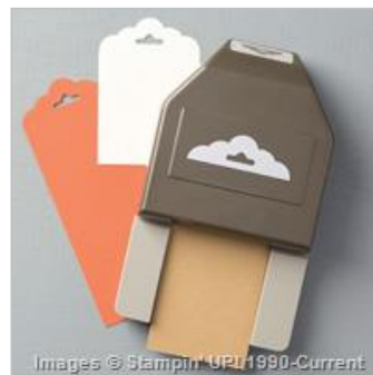
Scalloped Tag Topper Punch