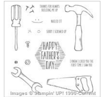
Nailed It Wood-Mount Stamp Set