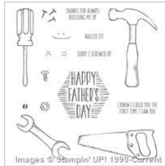
Nailed It Clear-Mount Stamp Set