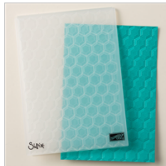
Hexagons Dynamic Textured Impressions Embossing Folder