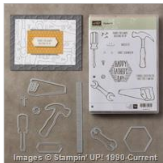
Nailed It Wood-Mount Bundle