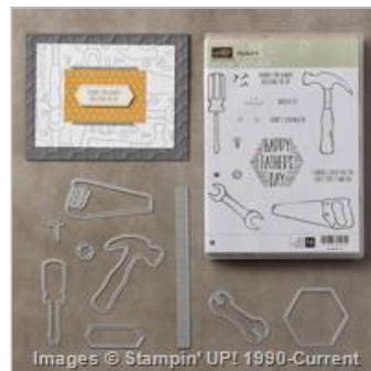
Nailed It Wood-Mount Bundle