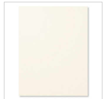
Very Vanilla 8-1/2" X 11" Cardstock