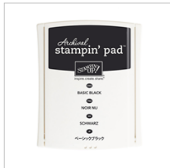
Basic Black Archival Stampin' Pad