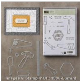
Nailed It Clear-Mount Bundle