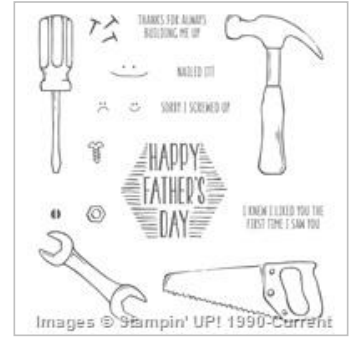
Nailed It Wood-Mount Stamp Set