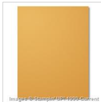
Delightful Dijon 8-1/2" X 11" Cardstock