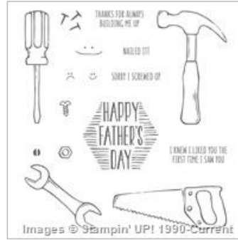
Nailed It Clear-Mount Stamp Set