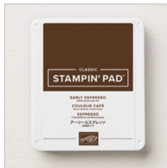
Early Espresso Classic Stampin' Pad