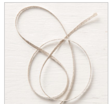
3/16" (1 Cm) Braided Linen Trim