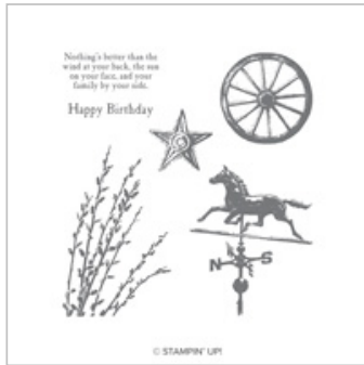
Country Road Clear-Mount Stamp Set