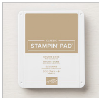
Crumb Cake Classic Stampin' Pad