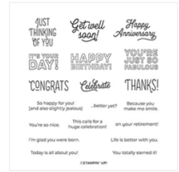
Many Mates Cling Stamp Set (En) - 152633