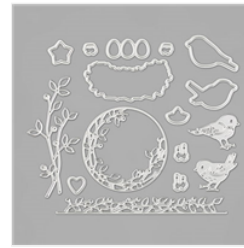
Birds & More Dies - 152721