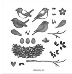
Birds & Branches Photopolymer Stamp Set - 152570