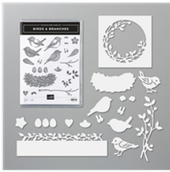
Birds & Branches Bundle (En) - 154107