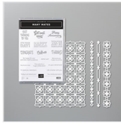
Many Mates Bundle (En) - 154083