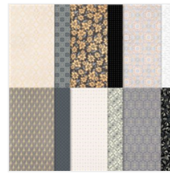
Simply Elegant 12" X 12" (30.5 X 30.5 Cm) Specialty Designer Series Paper - 155761