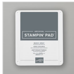
Basic Gray Classic Stampin' Pad - 149165