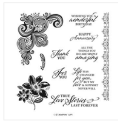
Elegantly Said Cling Stamp Set - 155095