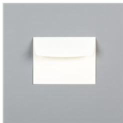
Very Vanilla Medium Envelopes - 107300