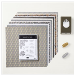
Simply Elegant Suite Collection (English) - 155764