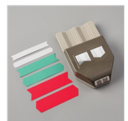
Banners Pick A Punch - 153608