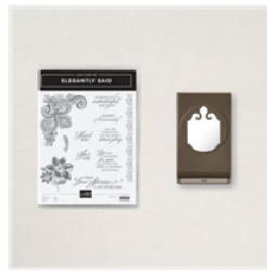
Elegantly Said Bundle (English) - 155753