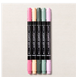
2021-2023 In Color Stampin' Write Markers - 155639