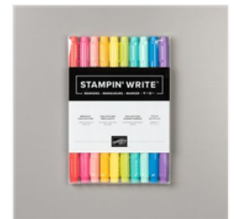
Brights Stampin' Write Markers - 147157