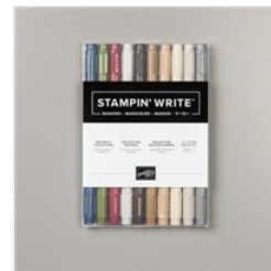
Neutrals Stampin' Write Markers - 147158