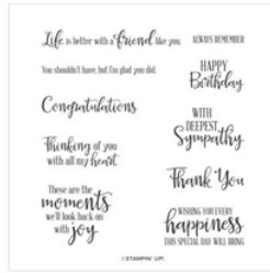
Peaceful Moments Cling Stamp Set (En) - 151595