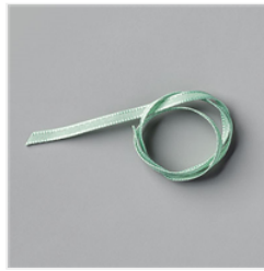
Mint Macaron 1/8" (3.2 Mm) Sheer Linen Ribbon - 151321