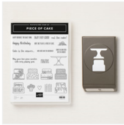
Piece Of Cake Photopolymer Bundle - 150579