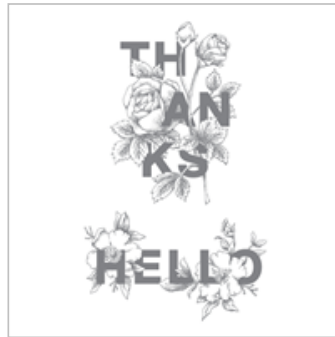
Floral Statements Wood-Mount Stamp