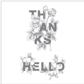
Floral Statements Clear-Mount Stamp