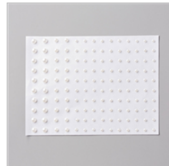
Pearl Basic Jewels