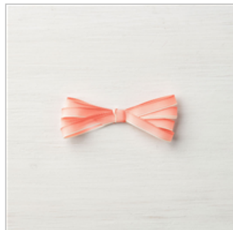
Calypso Coral 1/4"