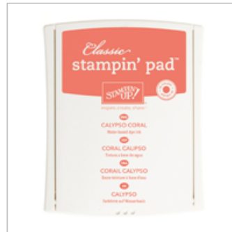
Calypso Coral Classic Stampin' Pad