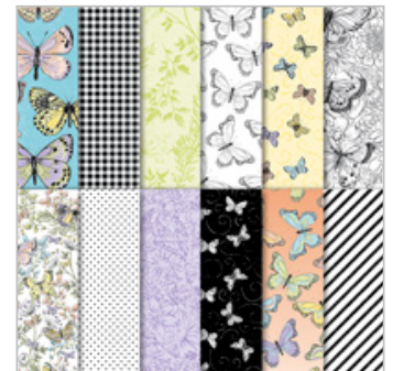
Botanical Butterfly Designer Series