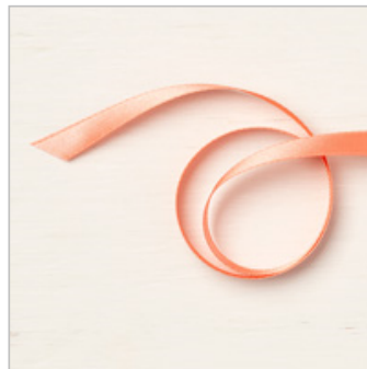
Calypso Coral 3/8" (1 Cm) Satin Ribbon