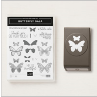
Butterfly Gala Photopolymer Bundle