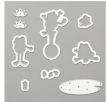
Hop Around Framelits Dies