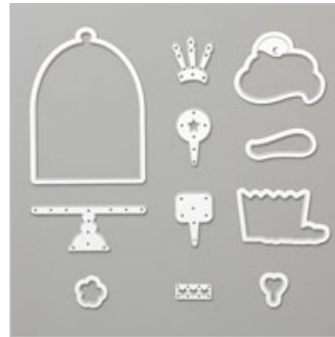
Call Me Cupcake Framelits Dies