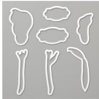
Lily Framelits Dies