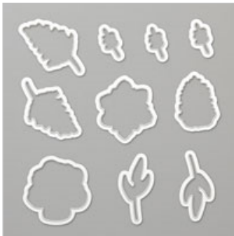
Four Seasons Framelits Dies