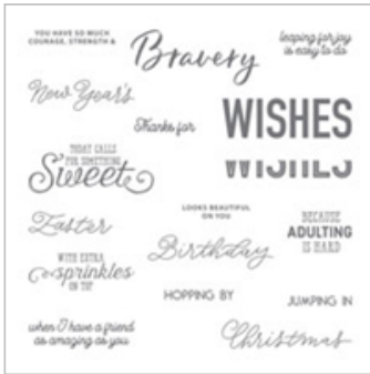
More Than Words Photopolymer Stamp