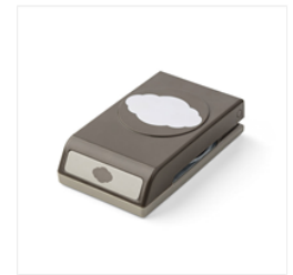
Pretty Label Punch