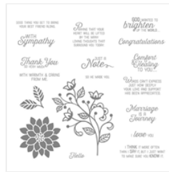
Flourishing Phrases Clear-Mount Stamp Set