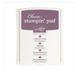
Perfect Plum Classic Stampin' Pad