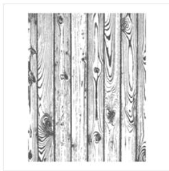
Hardwood Clear-Mount Stamp

susan@pumpkinhillstampers.com pumpkinhillstampers.com