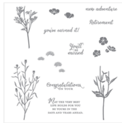
Wild About Flowers Photopolymer Stamp Set