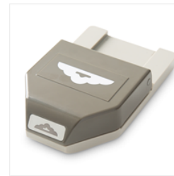
Scalloped Tag Topper Punch