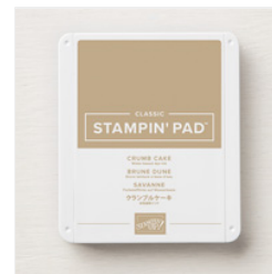
Crumb Cake Classic Stampin' Pad