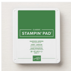
Garden Green Classic Stampin' Pad