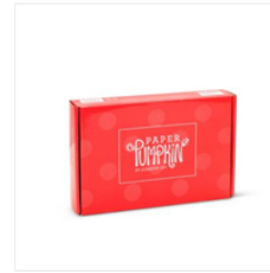
Prepaid Paper Pumpkin Subscription 1- Month - 137858