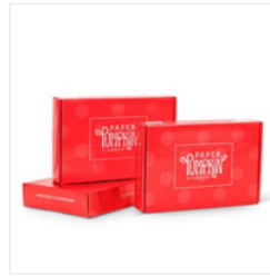
Prepaid Paper Pumpkin Subscription 3- Month - 137859