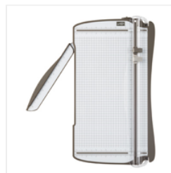
Stampin' Trimmer - 126889