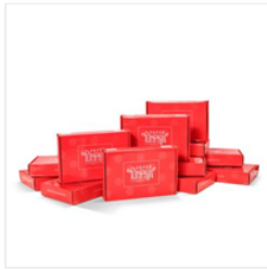
Prepaid Paper Pumpkin Subscription 12- Month - 137861