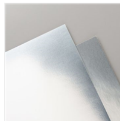
Silver Foil Sheets - 132178