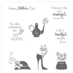
A Mother's Flair Clear-Mount Stamp Set - 145905