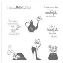
A Mother's Flair Clear-Mount Stamp Set - 145905