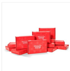
Prepaid Paper Pumpkin Subscription 12- Month - 137861