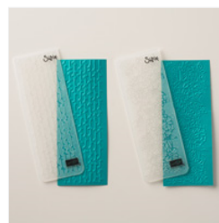
Petal Pair Textured Impressions Embossing Folders - 145656