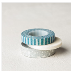
Myths & Magic Specialty Washi Tape - 145602