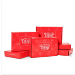
Prepaid Paper Pumpkin Subscription 6- Month - 137860