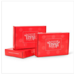
Prepaid Paper Pumpkin Subscription 3- Month - 137859