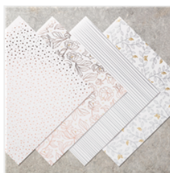
Springtime Foils Specialty Designer Series Paper - 147193