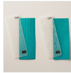
Petal Pair Textured Impressions Embossing Folders - 145656