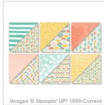
Best Year Ever Designer Series