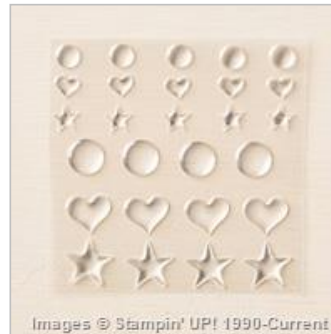
Itty Bitty Accents Epoxy Stickers