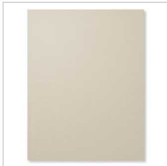
Sahara Sand A4 Cardstock