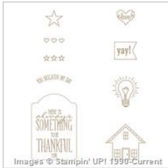
You Brighten My Day Wood Stamp Set