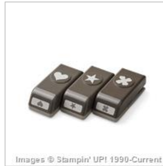
Itty Bitty Accents Punch Pack