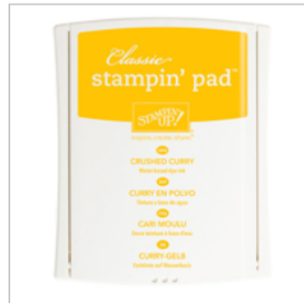
Crushed Curry Classic Stampin' Pad