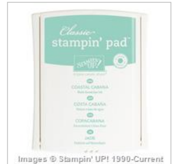
Coastal Cabana Classic Stampin' Pad