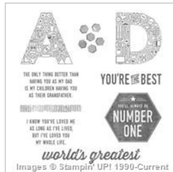
Urban District Wood-Mount Stamp Set