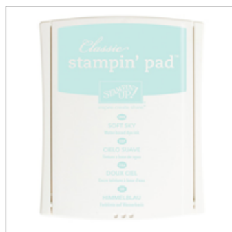
Soft Sky Classic Stampin' Pad