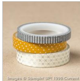
Urban Underground Designer Washi Tape