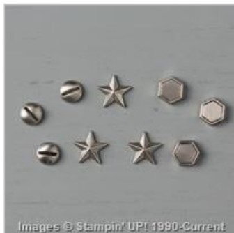
Urban Underground Embellishments