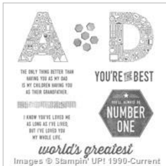
Urban District Clear-Mount Stamp Set