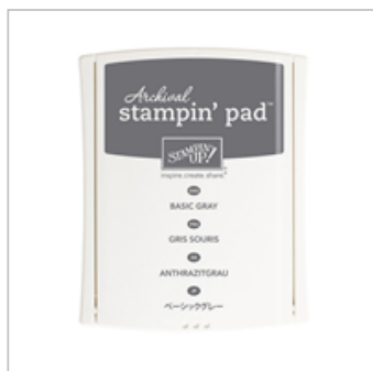
Basic Gray Archival Stampin' Pad