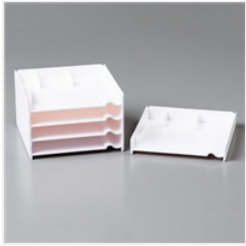
Ink Pad & Marker Storage - 149168