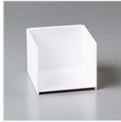
Open Storage - 149171