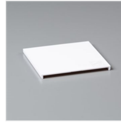
Topper Lid - 149167