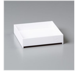
Topper Storage - 149170