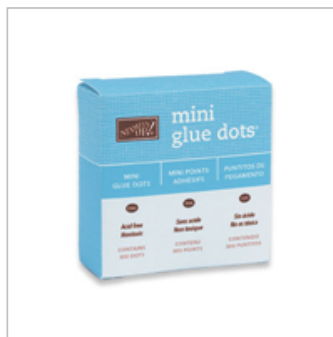
Mini Glue Dots