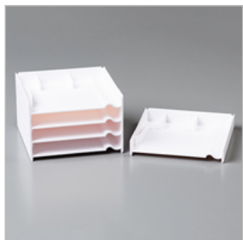
Ink Pad & Marker Storage Trays