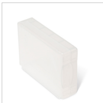
Half Wide Stamp Cases