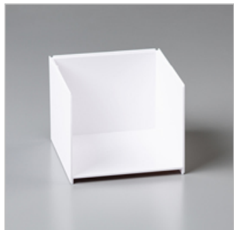
Open Storage Cube