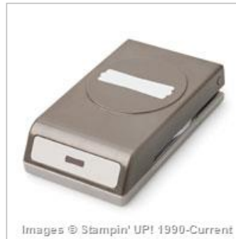
Modern Label Punch