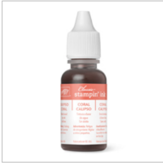
Calypso Coral Classic Stampin' Ink Refill