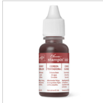
Cherry Cobbler Classic Stampin' Ink