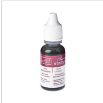
Rich Razzleberry Classic Stampin' Ink