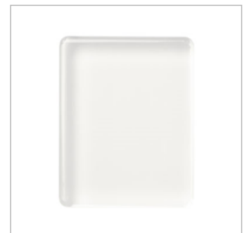
Clear Block E