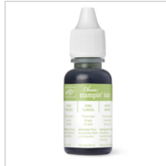
Pear Pizzazz Classic Stampin' Ink Refill