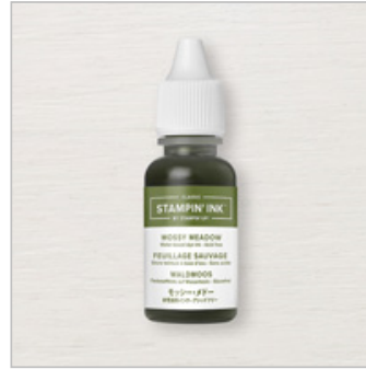
Mossy Meadow Classic Stampin' Ink