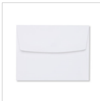
Whisper White Medium Envelopes