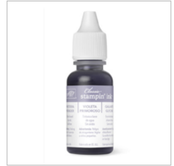
Wisteria Wonder Classic Stampin' Ink