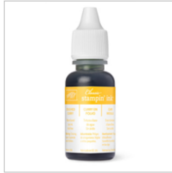
Crushed Curry Classic Stampin' Ink