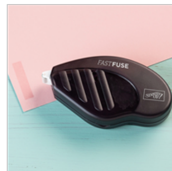
Fast Fuse Adhesive