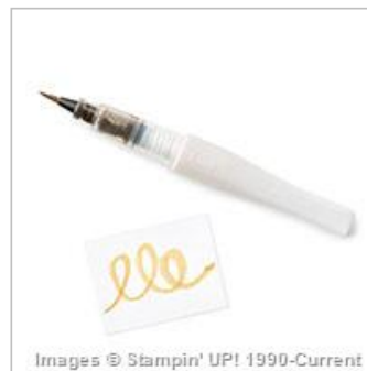
Gold Wink Of Stella Glitter Brush