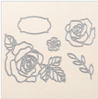
Rose Garden Thinlits