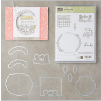
Charming Café Clear-Mount Bundle