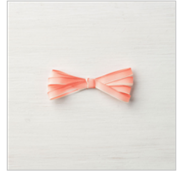
Calypso Coral 1/4" Ombre Ribbon