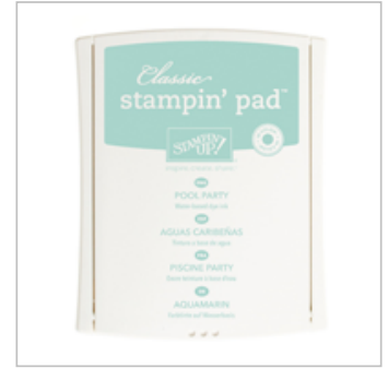
Pool Party Classic Stampin' Pad