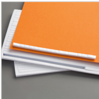
Foam Adhesive Strips