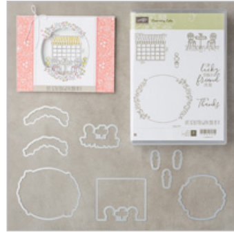
Charming Café Wood-Mount Bundle