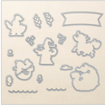
Magical Mates Framelits Dies