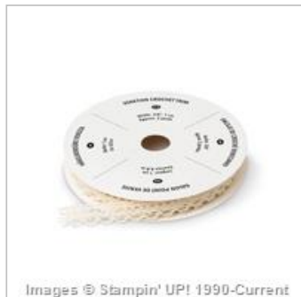
Venetian Crochet Trim