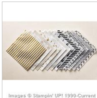
Winter Wonderland Designer Vellum Stack