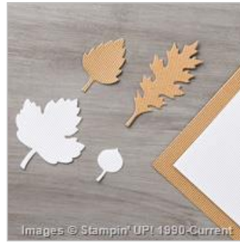
Kraft And White Corrugated Paper