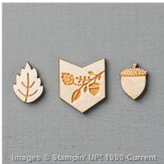
Into The Woods Elements