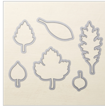
Leaflets Framelits Dies