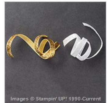
Gold & White 3/8" (1 Cm) Glitter Ribbon