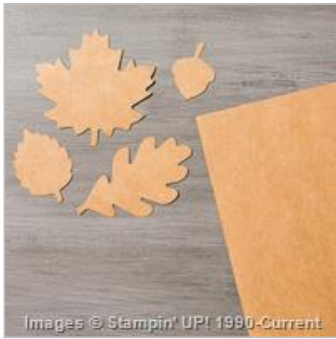
Kraft 12" X 12" (30.5 X 30.5 Cm) Cardstock