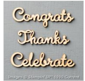
Expressions Natural Elements