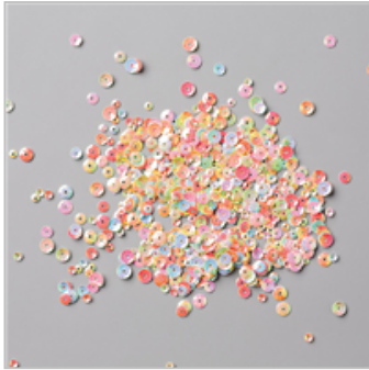
Iridescent Sequin Assortment