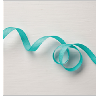
Bermuda Bay 3/8" Mini Chevron Ribbon