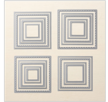
Layering Squares Framelits Dies