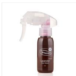
Lavender Color Splash - Including Nozzle - IP-0077