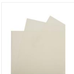
Clearview Sheets - CS-0121