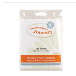
Journey Foam Squares - medium - AD-0085