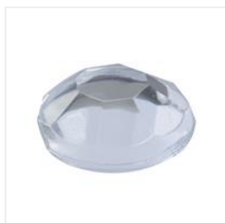
Cut Rhinestones - AC-0023