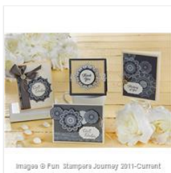
Bloom Box - KO-0001