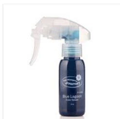
Blue Lagoon Color Splash - Including Nozzle - IP-0084