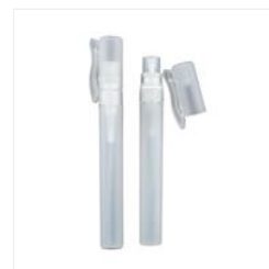
Media Mister - TO-0121