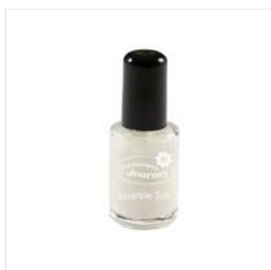
Sparkle Silk - IP-0126