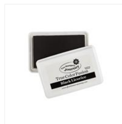
Black Licorice True Color Fusion Ink Pad - IP-0041