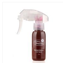
Watermelon Color Splash - Including Nozzle - IP-0083