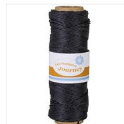
Journey Twine Black - AC-0004