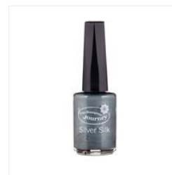
Silver Silk - IP-0090