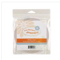
White Liner - AD-0001