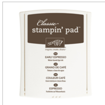
Early Espresso Classic Stampin' Pad