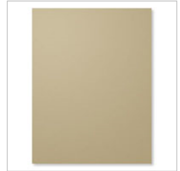
Crumb Cake A4 Cardstock