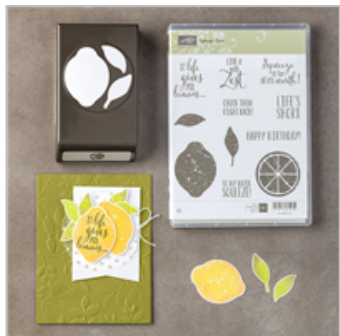
Lemon Zest Clear-Mount Bundle