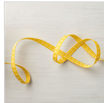
Daffodil Delight 1/4" Double-Stitched Ribbon