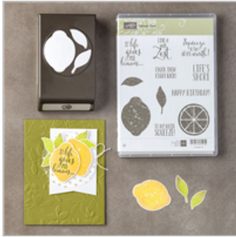
Lemon Zest Clear-Mount Bundle