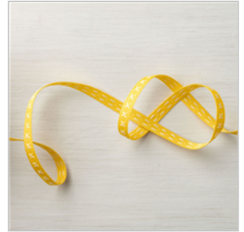
Daffodil Delight 1/4" Double-Stitched Ribbon