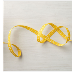
Daffodil Delight 1/4" Double- Stitched Ribbon - 144116