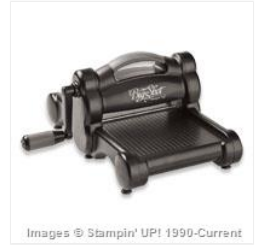
Big Shot - 113439