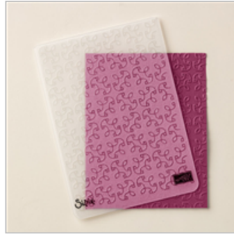
Garden Trellis Textured Impressions Embossing Folder