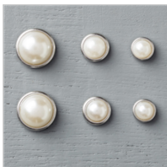
Metal Rimmed Pearls