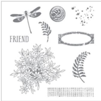
Awesomely Artistic Clear-Mount Stamp