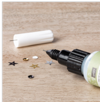
Fine-Tip Glue Pen