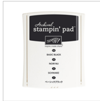
Basic Black Archival Stampin' Pad