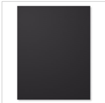
Basic Black 8-1/2" X 11" Cardstock