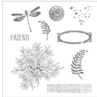
Awesomely Artistic Wood-Mount Stamp