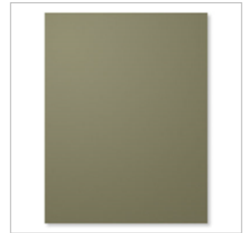
Always Artichoke 8-1/2" X 11" Cardstock