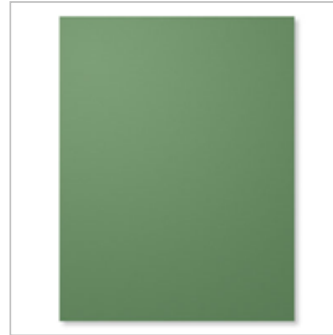
Garden Green 8-1/2"