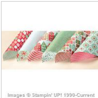
Nordic Noel Designer