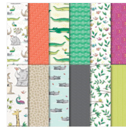
Animal Expedition Designer Series Paper - 146902