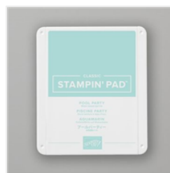
Pool Party Classic Stampin' Pad - 147107