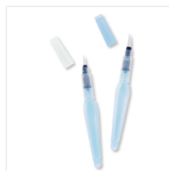
Aqua Painters - 103954