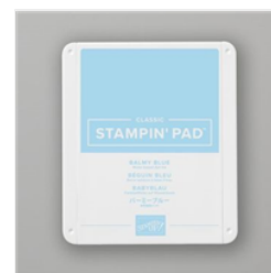
Balmy Blue Classic Stampin' Pad - 147105