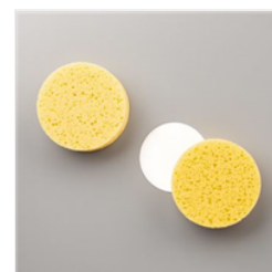
Stamping Sponges - 141337