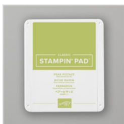
Pear Pizzazz Classic Stampin' Pad - 147104