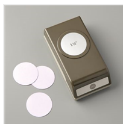
1-1/2" (3.8 Cm) Circle Punch - 138299