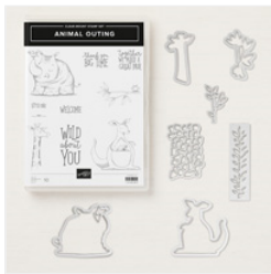
Animal Outing Clear-Mount Bundle - 148324