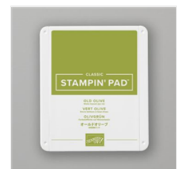
Old Olive Classic Stampin' Pad - 147090