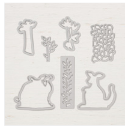
Animal Friends Dies - 146823