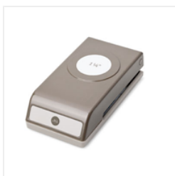
1-1/4" (3.2 Cm) Circle Punch - 119861