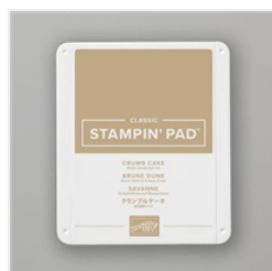
Crumb Cake Classic Stampin' Pad - 147116