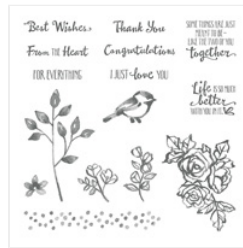
Petal Palette Clear-Mount Stamp Set - 145788