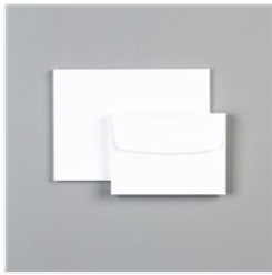
Whisper White Note Cards & Envelopes - 131527