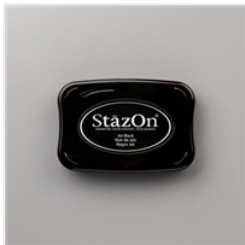
Jet Black Stazon Pad - 101406