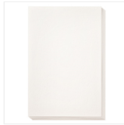
Watercolor Paper - 122959