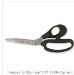
Craft Scissors - 108360