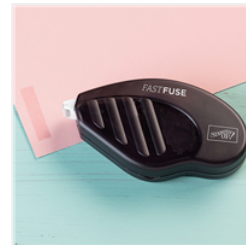
Fast Fuse Adhesive - 129026