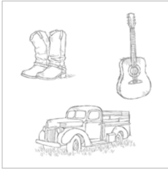
Country Livin' Clear-Mount Stamp Set