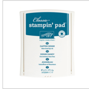
Dapper Denim Classic Stampin' Pad