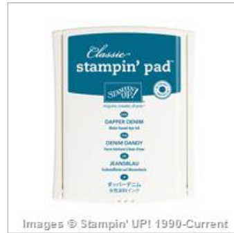
Dapper Denim Classic Stampin' Pad