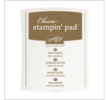
Soft Suede Classic Stampin' Pad