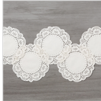
Delicate White Doilies