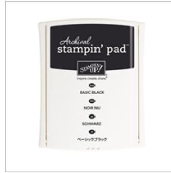
Basic Black Archival Stampin' Pad