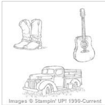
Country Livin' Clear-Mount Stamp Set