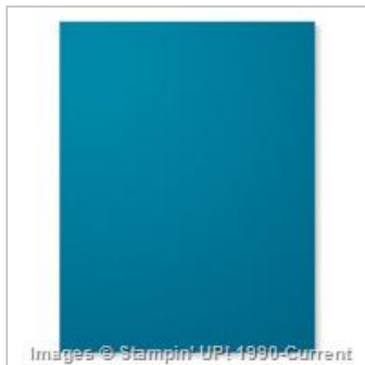
Dapper Denim 8-1/2 X 11" Cardstock