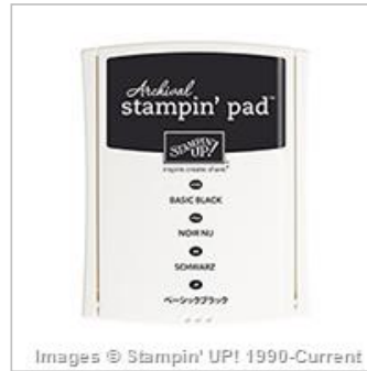
Basic Black Archival Stampin' Pad