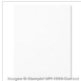
Whisper White 8-1/2 X 11" Cardstock