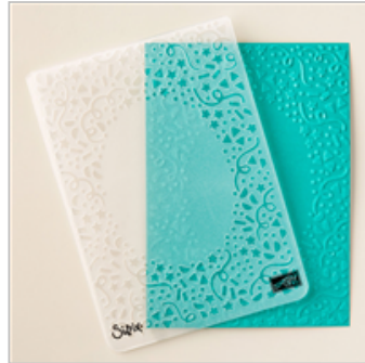
Confetti Textured Impressions Embossing Folder