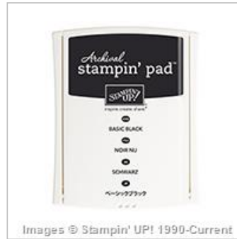
Basic Black Archival Stampin' Pad